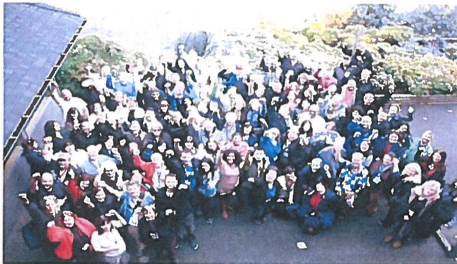
COAST BASTION INN